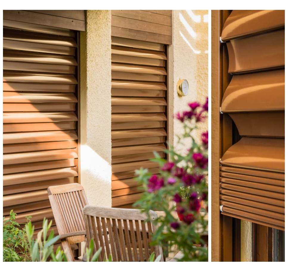
APARTMENT BUILDING, ST. GALLEN