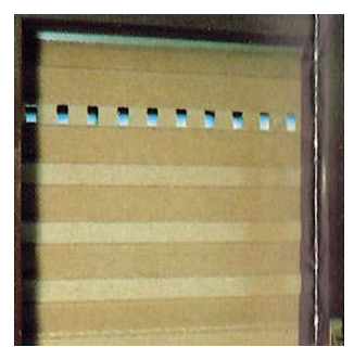
Slits can be closed by a slider, in one or more slats.