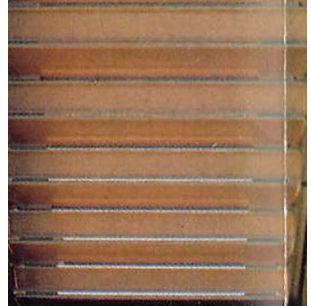
Indirect ventilation and light slits between all slats. No slits are visible from the