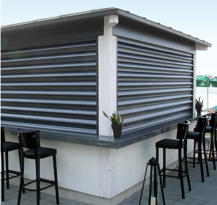
SINGLE-FAMILY HOUSES, VILLAS