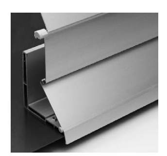
WIDE SLATS (BL) LINTEL WIDTH 135